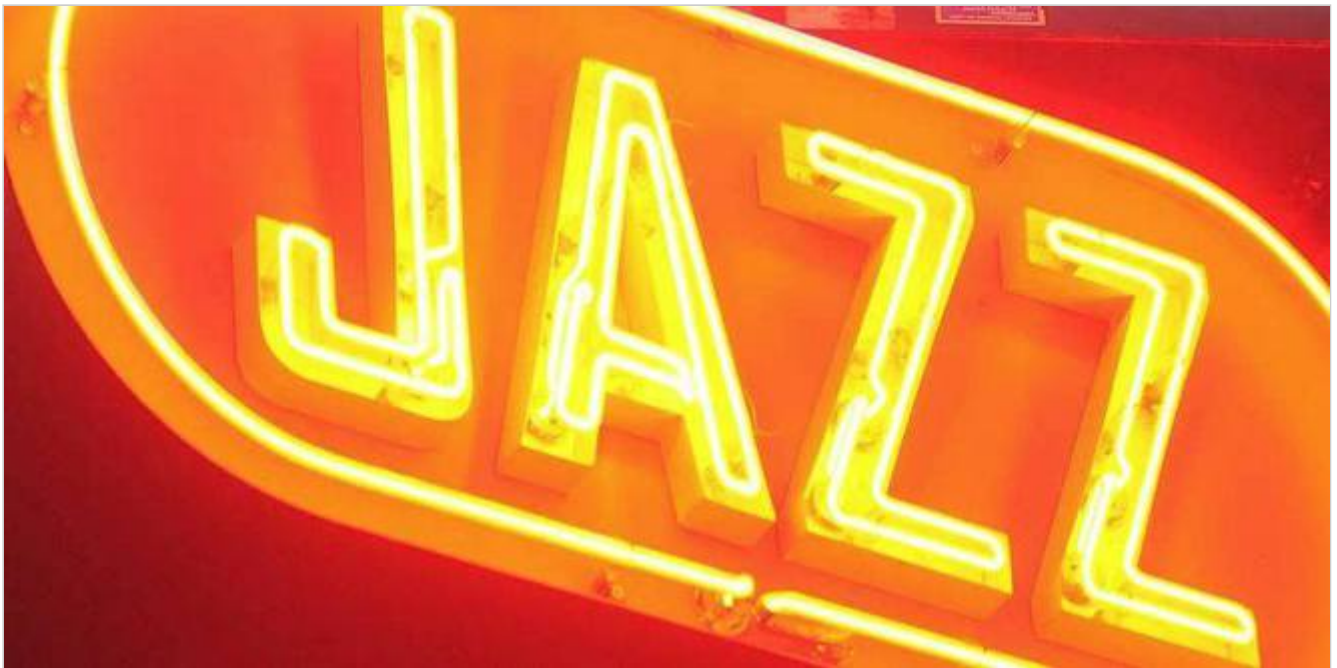
large image