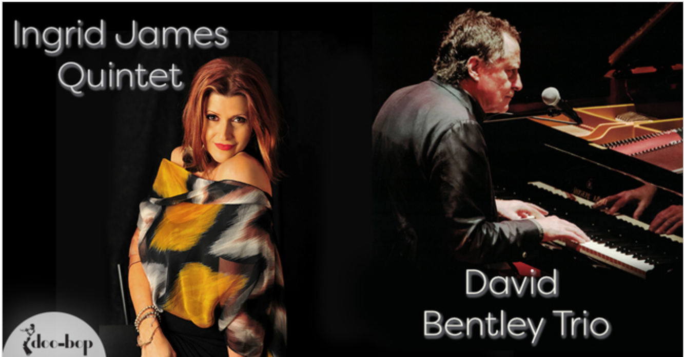
large image